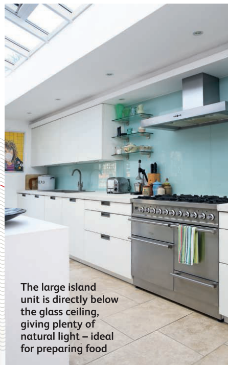
The large island unit is directly below the glass ceiling, giving plenty of natural light – ideal for preparing food