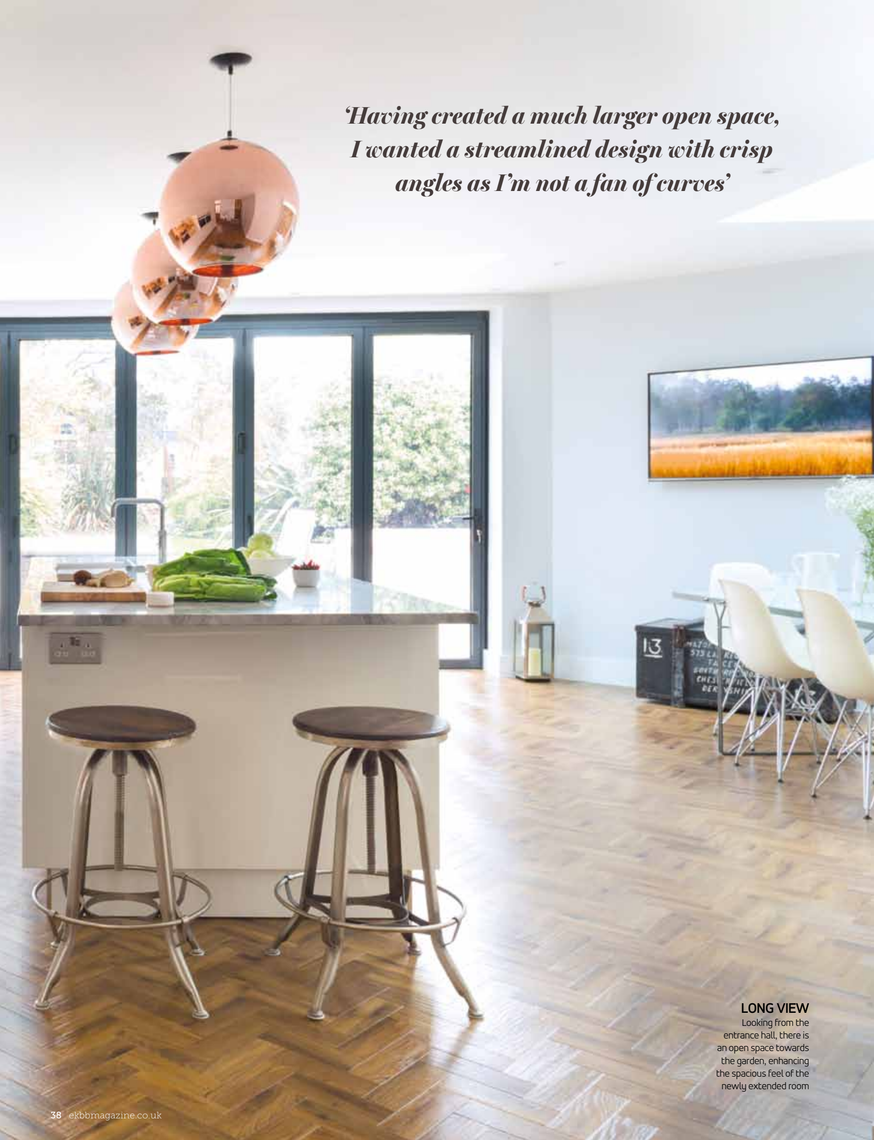
LONG VIEW Looking from the entrance hall, there is an open space towards the garden, enhancing the spacious feel of the newly extended room

'Having created a much larger open space, I wanted a streamlined design with crisp angles as I'm not a fan of curves'